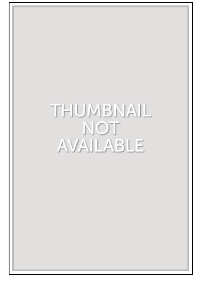
Filesize: 8 MB